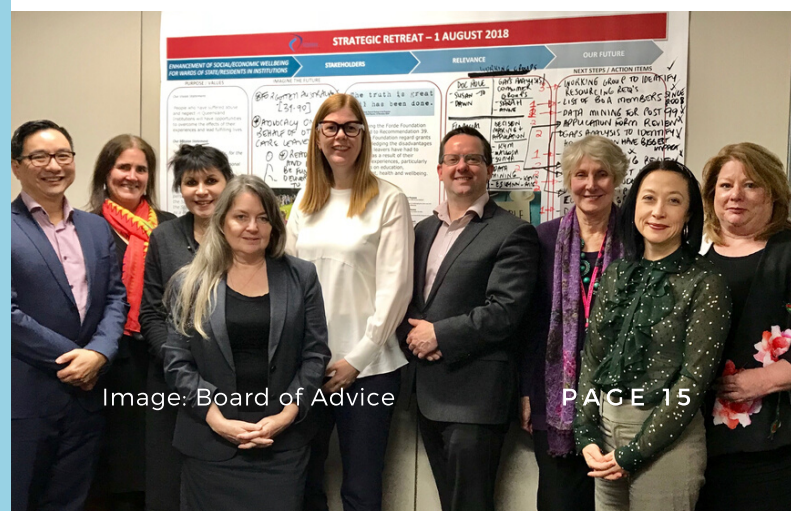
Image: Board of Advice