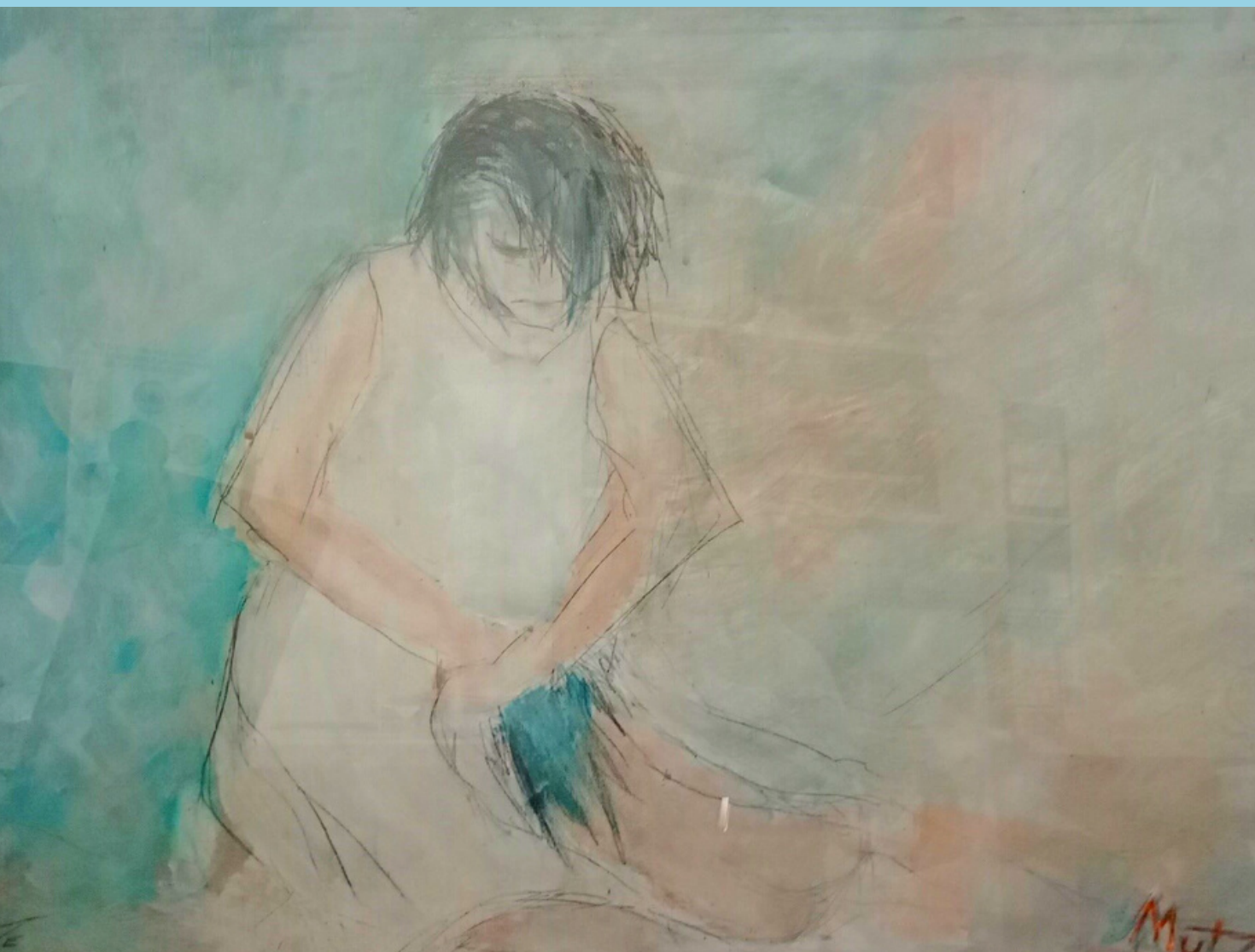
'THE CHILD WITHIN' BY JUDY MUTZE COMMISSIONED BY THE FORDE FOUNDATION OCTOBER 2018