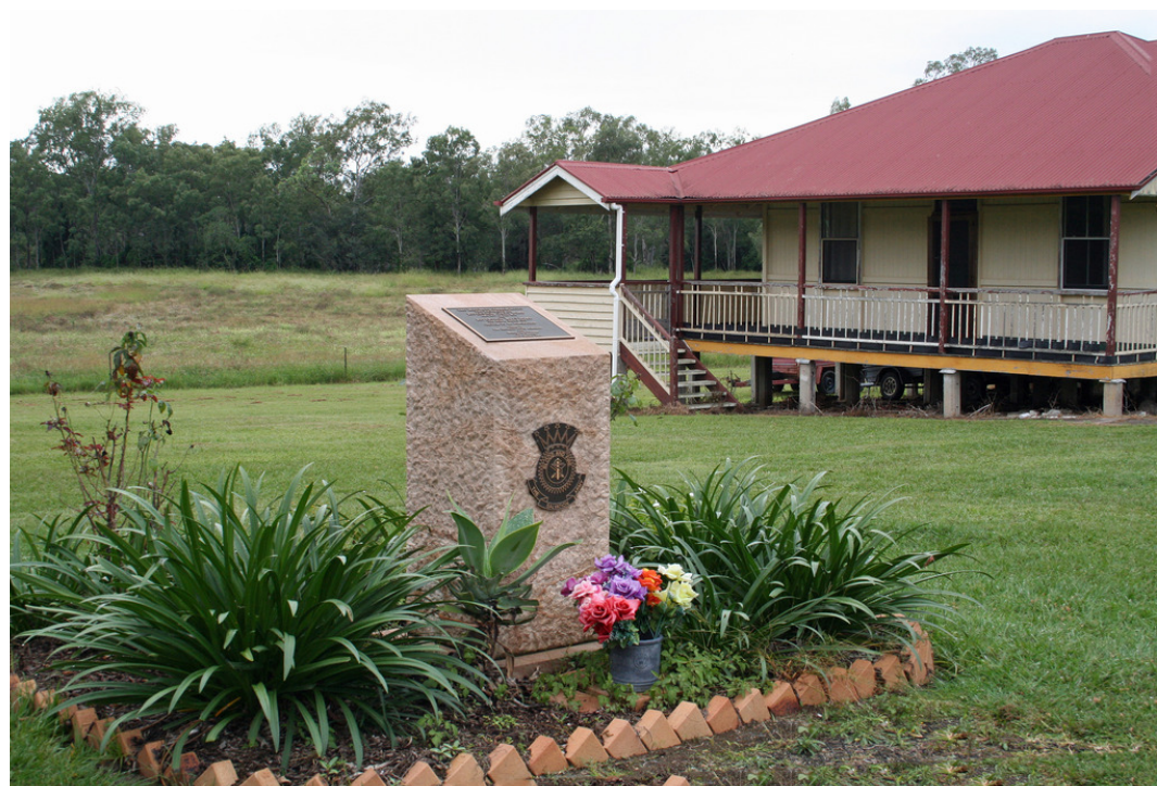
Top - The Children's Memorial Garden, Neerkol c. 2016. St Joseph's Home, Neerkol (1885 - 1978). Rockhampton.