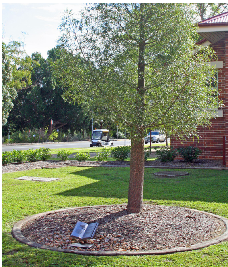
Top - Plaque dedicated to residents of Karrala House c. 2000. Karrala House (1963 - 1971). Ipswich.